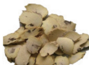
Caulis Clematidis Armandii (Chuan Mu Tong)