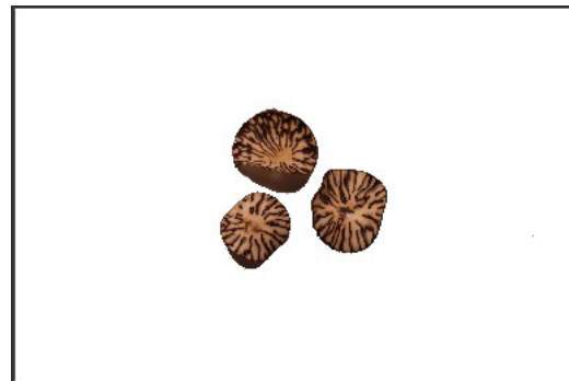
Figure 1 Hundred pieces areca

"Hundred pieces areca", that is, after moistening the areca, the workers cut out more than 100 pieces of thin sheets which are as thin as cotton paper [7]. Since areca is small and hard, it must be assisted with areca tongs. Holding the middle of the areca with an areca tong and placing it with the big head to the right, then hold the tong with your left hand and control the force. The left thumb and forefinger lean into the knife's bridge and slowly push it to the right. Hold the knife by the right hand and uses the wrist and arm power to cut. The left and right hands cooperate with each other to cut out thin, beautiful and complete areca pieces [8]. "Hundred pieces areca" skill fully demonstrates the charm of the culture of traditional Chinese medicine's processing in Anguo.(Fig. 1)