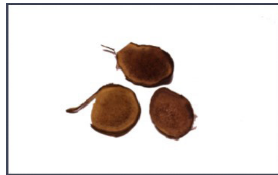
Figure 4 Conventional pilose antler

"Rhinoceros horn cooked by sword", that is to say is to make the Rhinoceros horn that is as hard as iron cut into a thin piece with a special steel shovel knife, shaped like shavings of wood. Rhino horn is a national banned drug. Because the effect of rhino horns and buffalo horns is similar, now the buffalo horn instead of Rhinoceros horns [14].(Fig. 4)