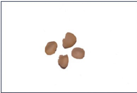
Figure 2 Pinellia ternata cooked like Cicada feat

white in appearance, hard and brittle, thin as a cicada feather, and it can project light when pinched to the light. It can reveal the words on the paper and you can take it off with a light blow when you put it in your palm. Basically, the size of horsebean-like Pinellia ternate can be cut out 108 pieces of decoction pieces just like cicada feather. The raw usually takes 6 months of preparation time to be cut [10]. It shows the quality and credibility of the processing of Traditional Chinese medicine decoction pieces in Anguo, as well as the operators' self-discipline and hardship.(Fig. 2)