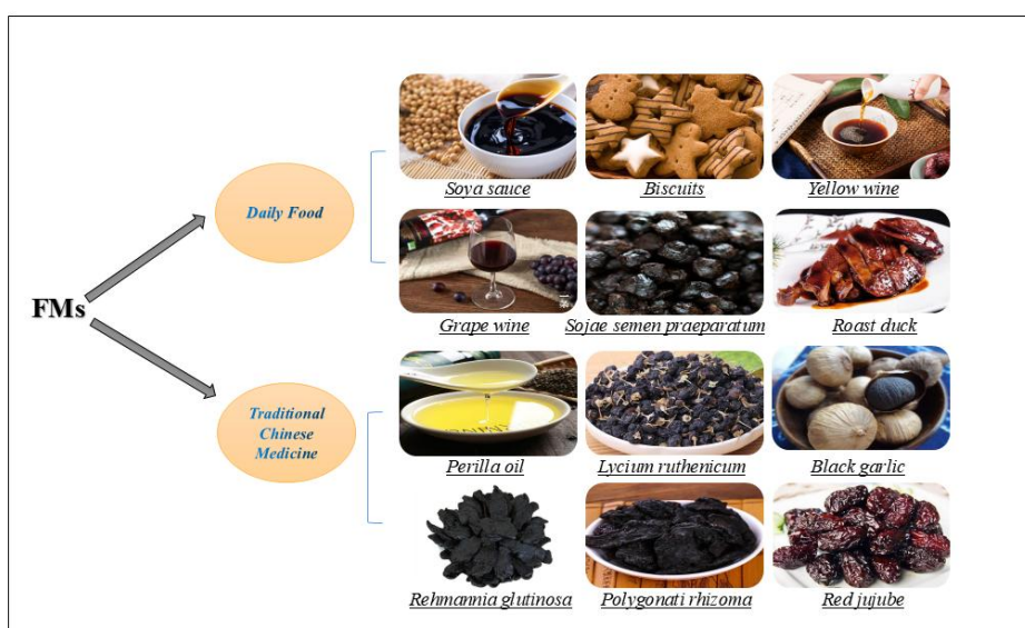
Figure 1 Typical foods and TCM with brown or black appearance